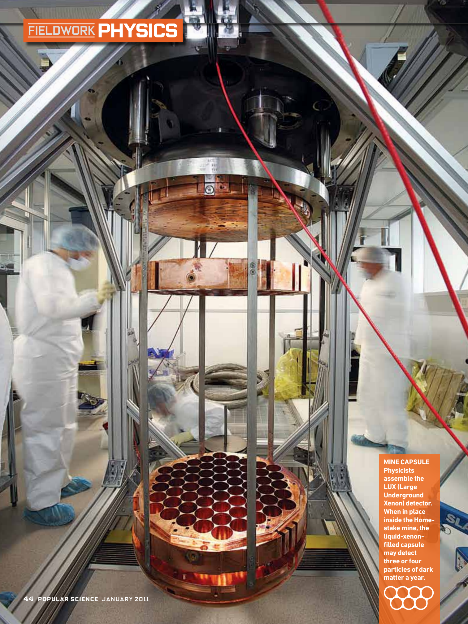
MINE CAPSULE Physicists assemble the LUX (Large Underground Xenon) detector. When in place inside the Homestake mine, the liquid-xenon-filled capsule may detect three or four particles of dark matter a year.

actually detect the dark matter—so precision is essential. But the various parts were machined at different sites, and without that perfect seal, air and impurities could infiltrate the experiment, potentially compromising the results. As Tom Shutt, a physicist at Case Western Reserve University and the co-founder of the LUX project, explains, “We’ve been on pins and needles to know how tight this can will be.”